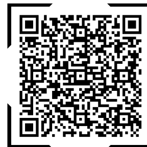
Submit an announcement request.