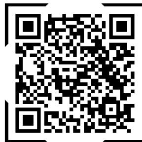
Full Church Calendar