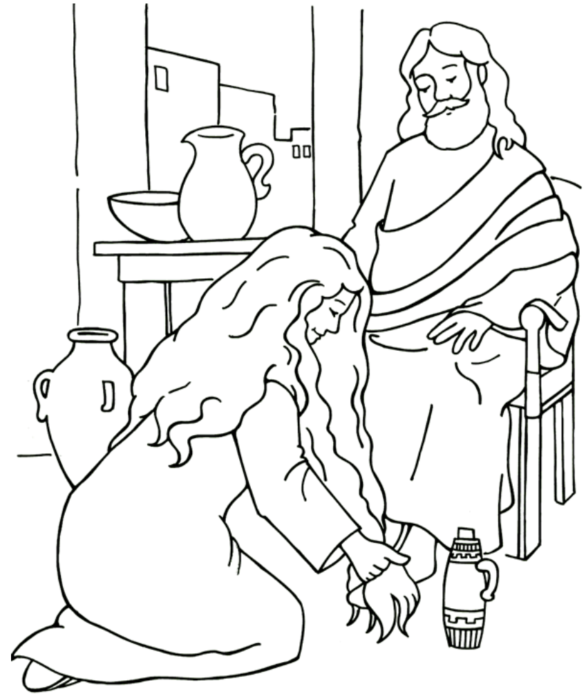
A Woman Anoints Jesus Mark 14

From Thru-the-Bible Coloring Pages for Ages 4-8. © Standard Publishing. Used by permission. Reproducible Coloring Books may be purchased from Standard Publishing, www.standardpub.com , 1-800-323-7543.