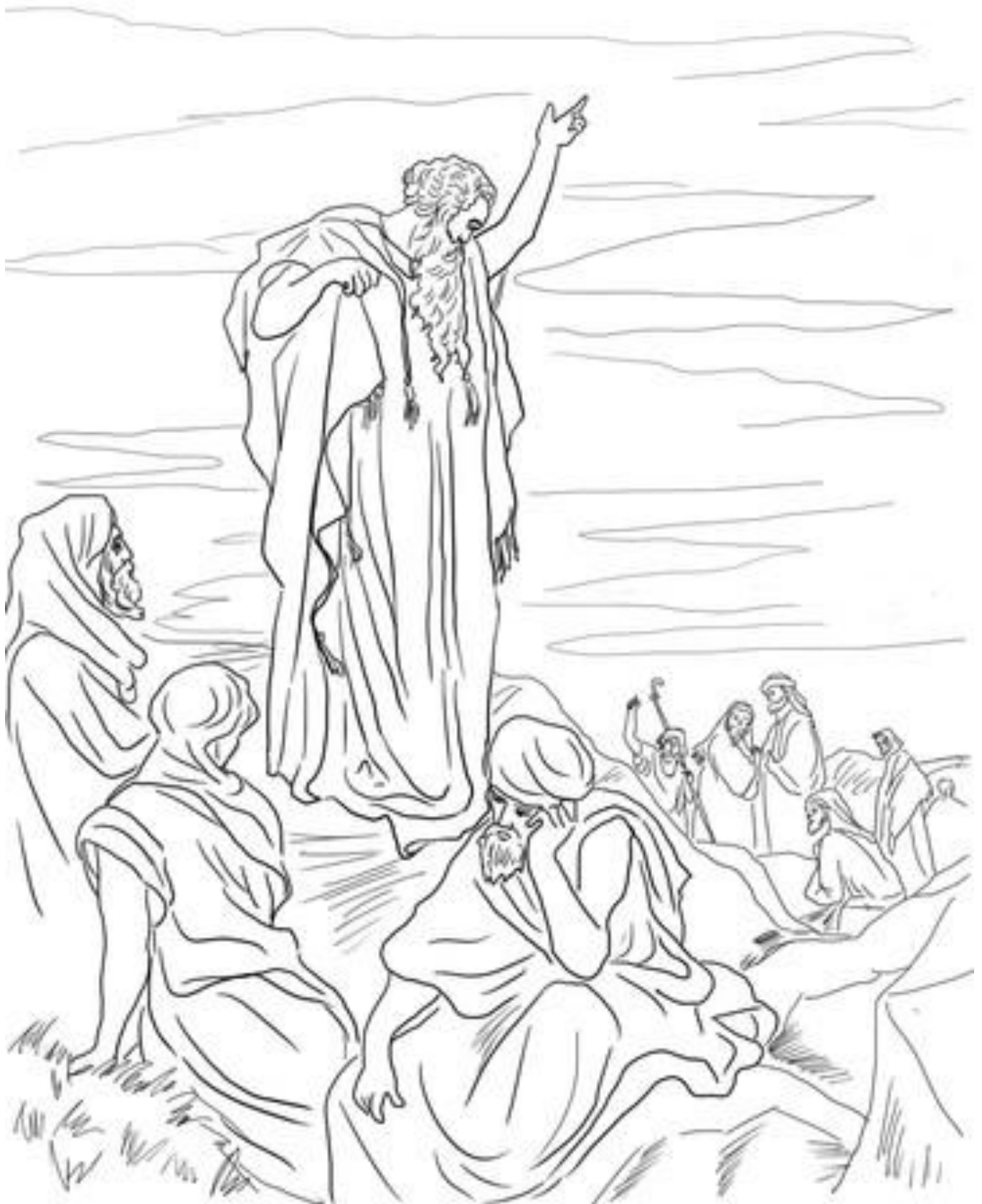
Ezekiel prophesying to the people of Israel