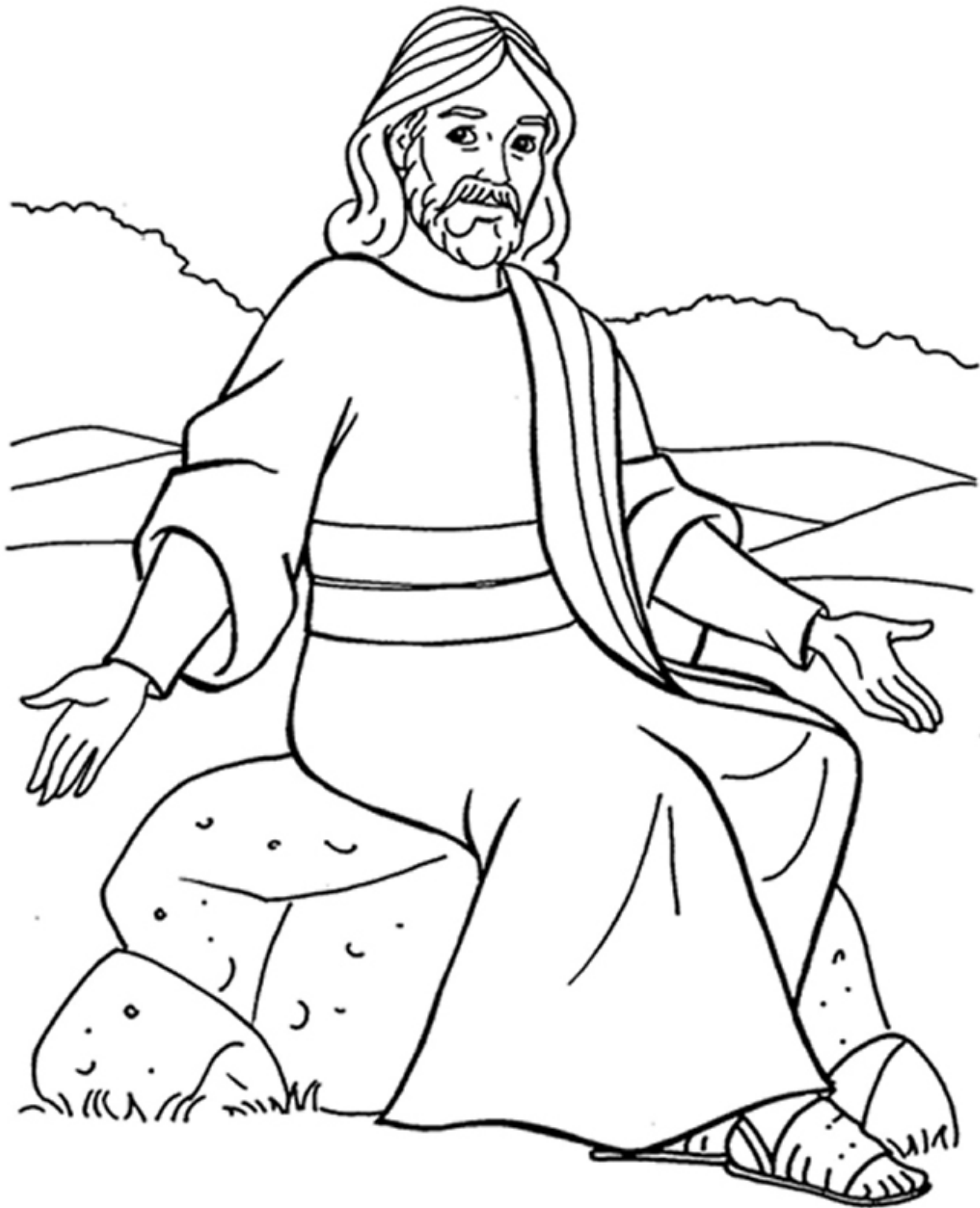
The Parable of the Weeds Matthew 13:24-30, 36-43