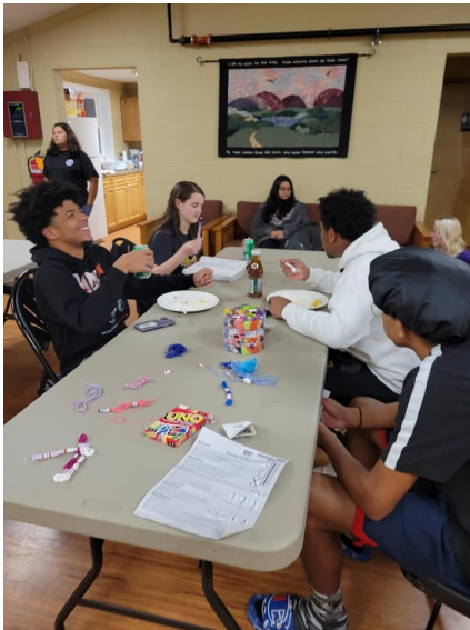
13 Senior High youth and 4 adults had a retreat at Camp Bays Mountain on November 5-7